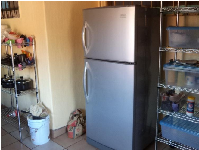
All new major appliances