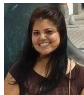
future nurse ... future Primary teacher