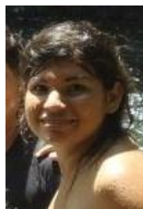
future nurse ... future Primary teacher