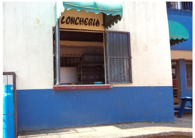
“the calm before the stampede”