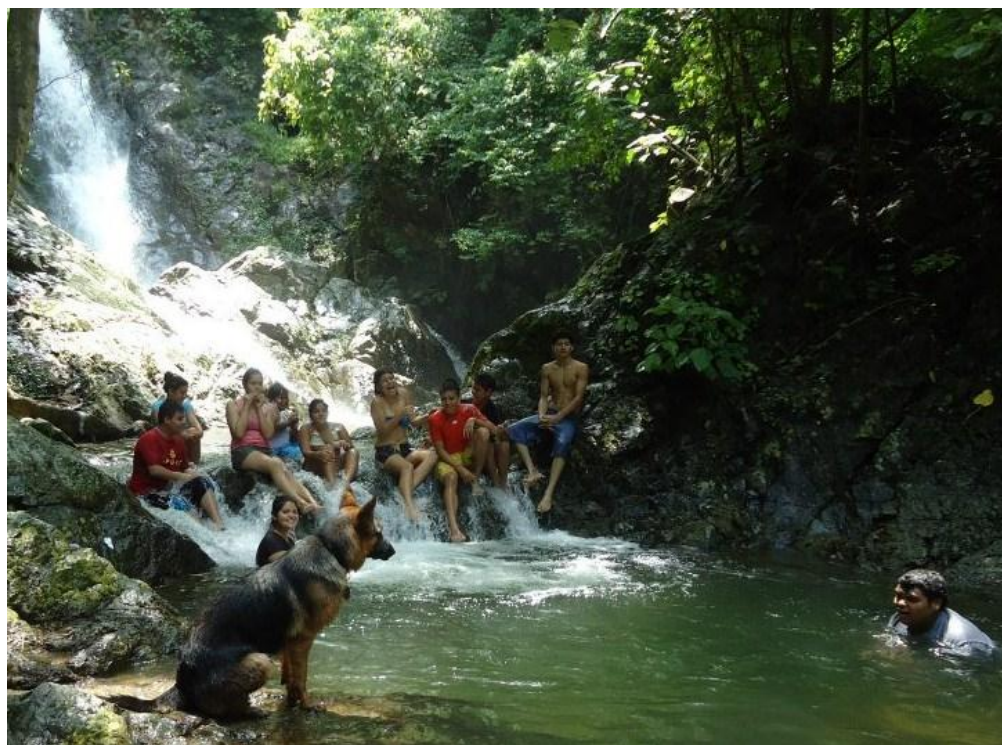
Photo: The annual hike & picnic up to El Capomo Falls this summer was beautiful. Recent rains filled the falls & pools with beauty and cool fresh water. CV offers recreation like this (w/private funding) with the intent of promoting the bonds of positive friendship ... Positive Friendship ... the fundamental catalyst that keeps the CV Program so strong. This outing occurred just before schools opened for the fall semester.