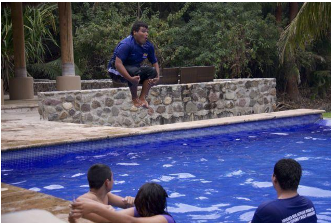
... then everyone hit the Clubhouse pool for a BIG WET welcome splash!

Thanks to Rotary International, many many volunteers and dedicated Mentors this Series of Learning-for-Life Programs was a powerful success.