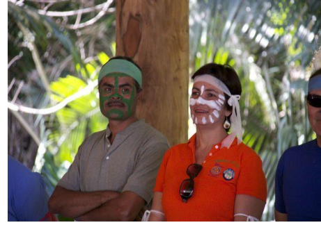
EIGHTY Students cram Palapa Tepee, as Pharaoh Deb reveals “Clues”, & Team “Mentors” stand by.