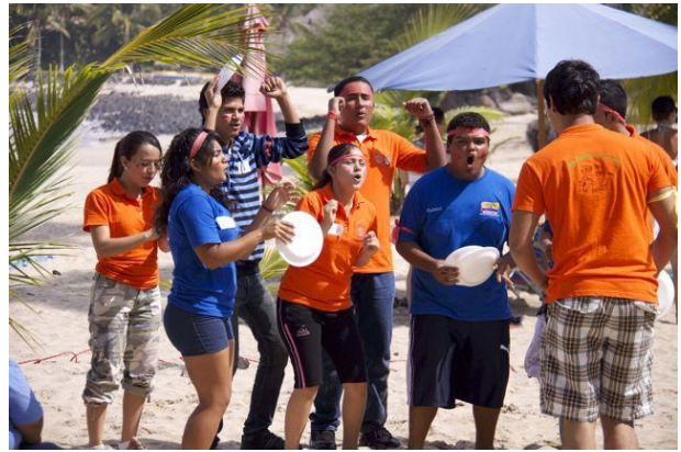
Teams combine Cambiando Vidas in Blue and La Peñita's Conelep in Orange ... Friends are made.